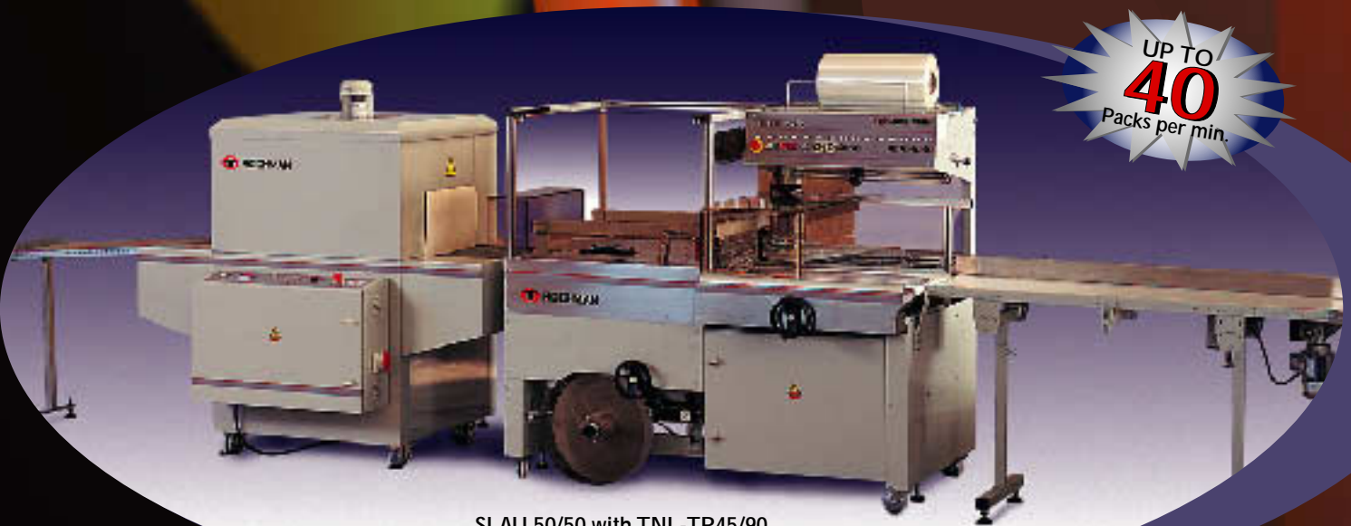
SLAU 50/50 with TNL-TR45/90 Infeed and Outfeed Conveyor Optional

STRATEGIC GROUP ® PACK FASTER, PACK SMARTER