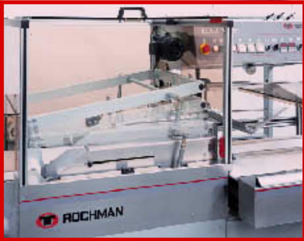
3-position height adjustable sealing jaw