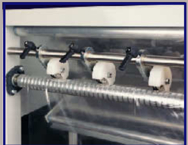
Adjustable mechanical film perforator