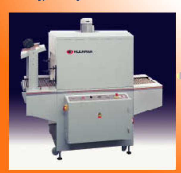
Shrink Tunnel Model TR 65 x 100 with optional cooling fan