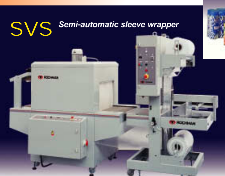
Versatile, ideal for collating packs